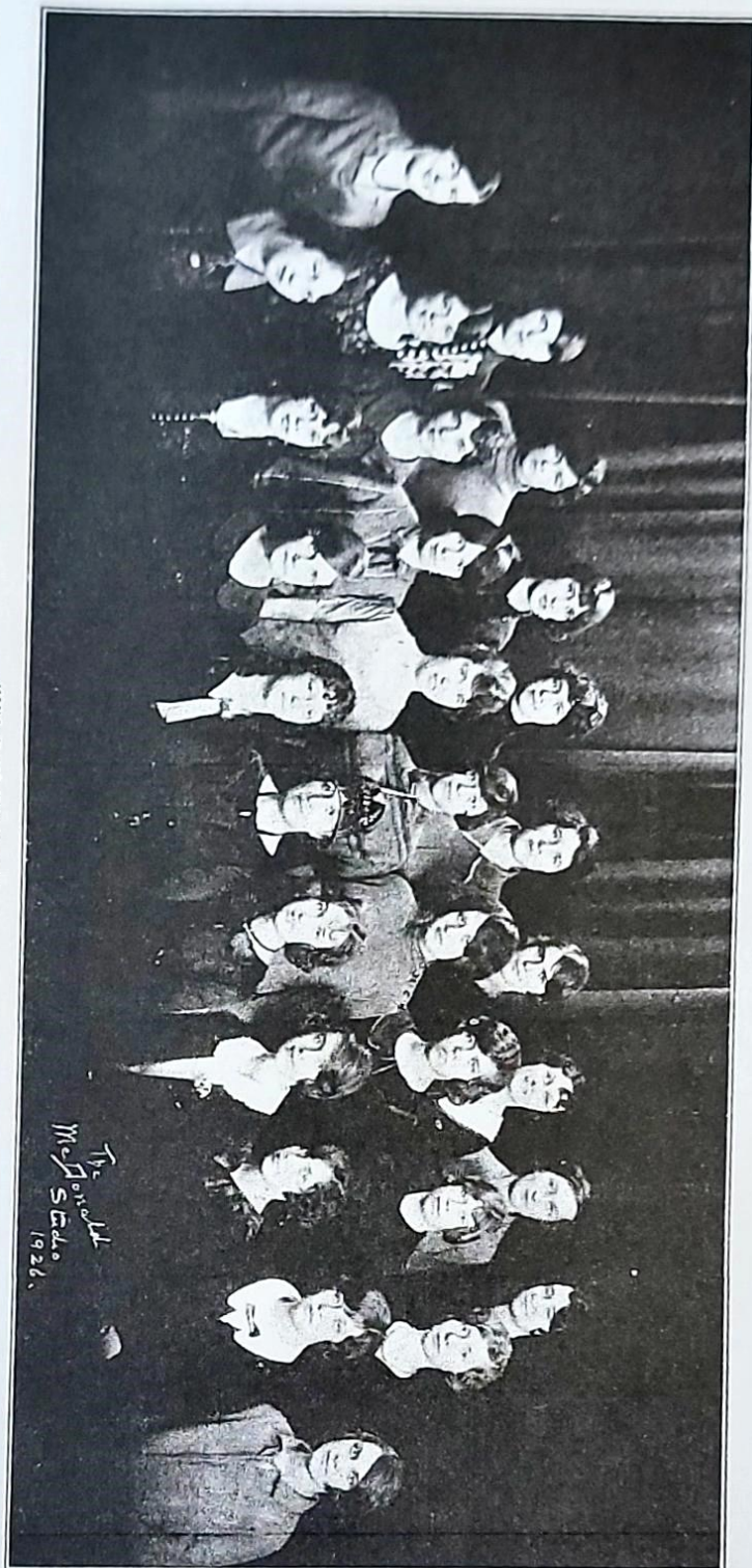
GIRLS' GLEE CLUB